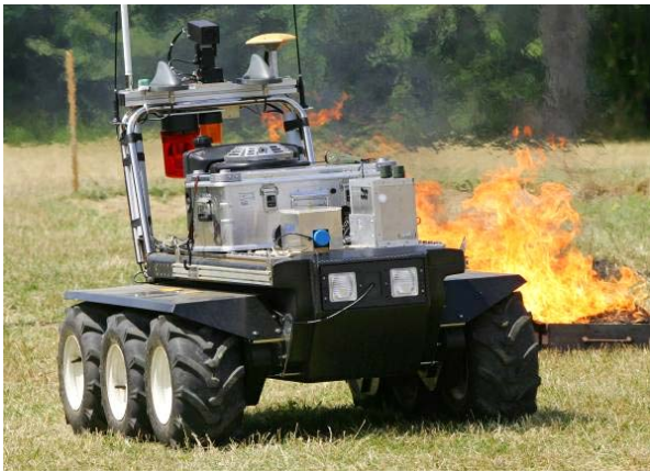
Name of vehicle: kutusow