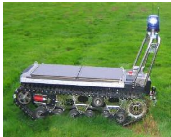
Name of vehicle: suworow