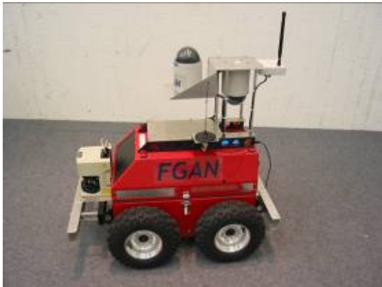
Name of vehicle: Scharnhorst