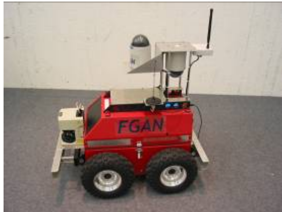
Name of vehicle: gneisenau