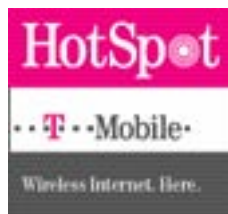
This logo means it's a HotSpot from T-Mobile!