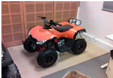
motorcycle purchased commercially

Name of vehicle: MX5 RQM ( Mantes eXplorer 5 Robot Quad militaire)